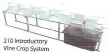
210 Introductory Vine Crop System (everything included)

Whether you want to supplement your income or build a career, we provide the systems and the support to make it happen... since 1984!